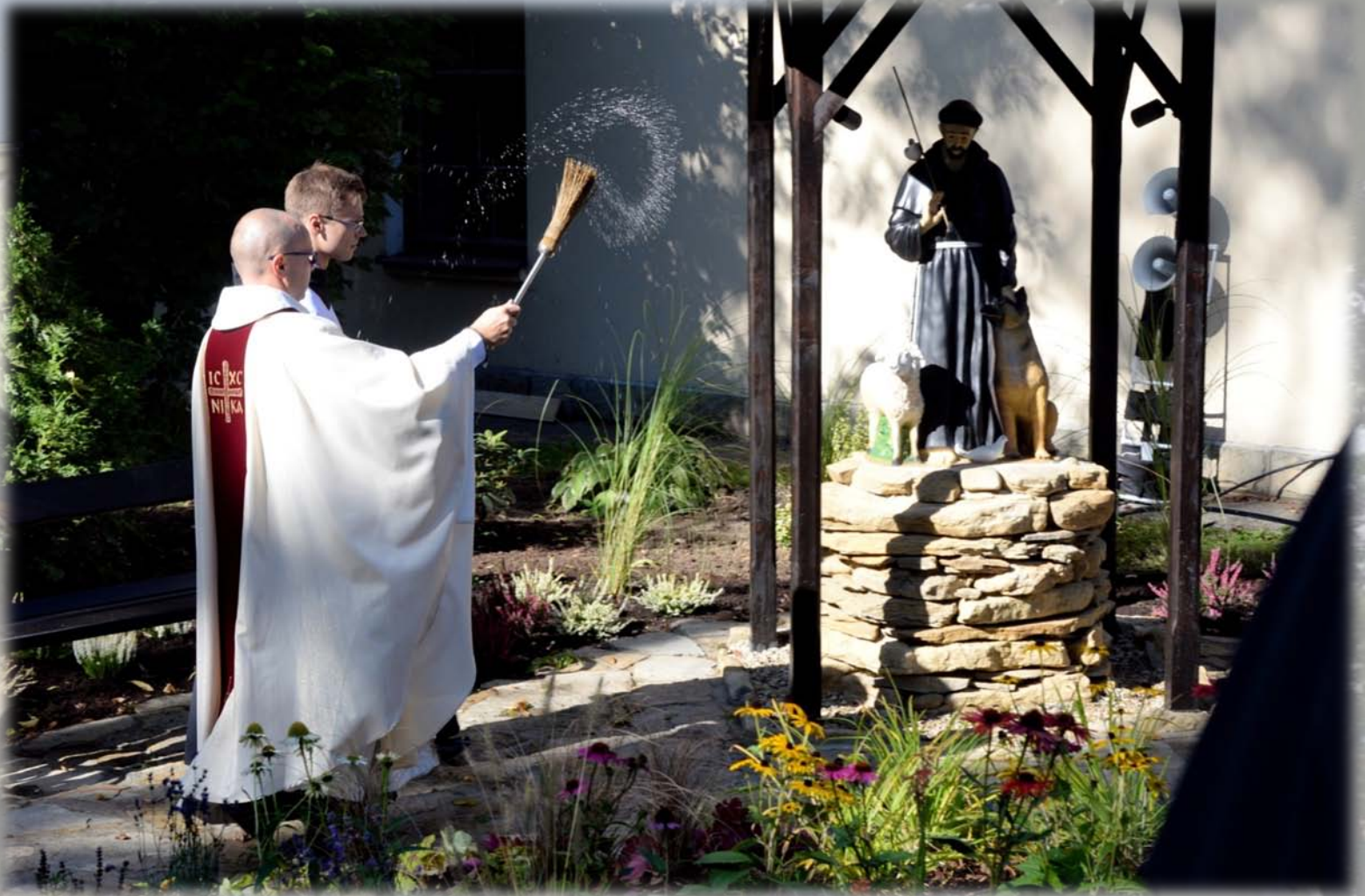
Consecration of a figure of St Francis, the patron of ecologists, 2015