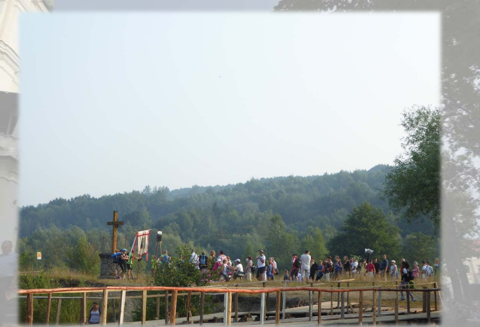
Crossing the Kidron (Wiar) River, 2015