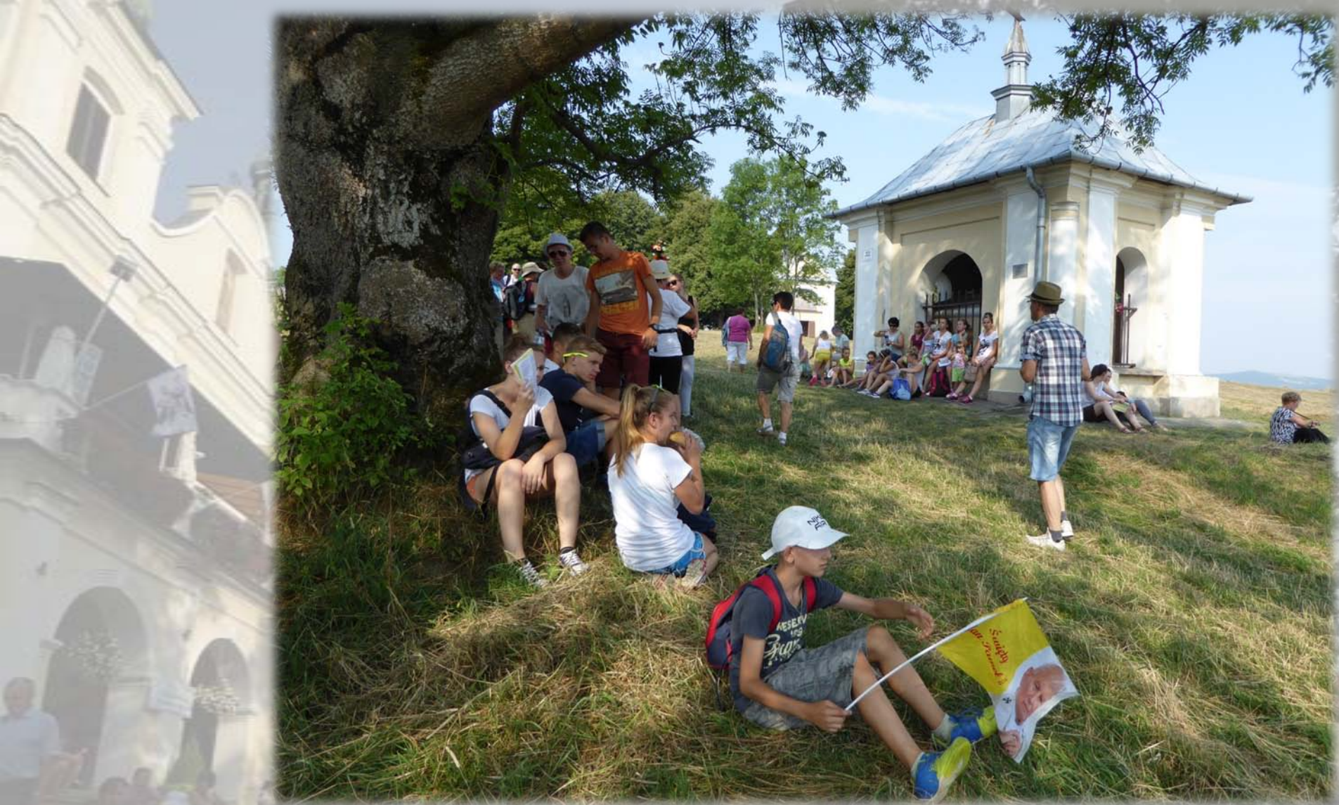
Chapel of Christ's third fall, 2015