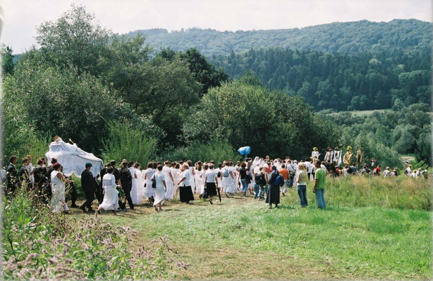
Funeral of Virgin Mary, 2007