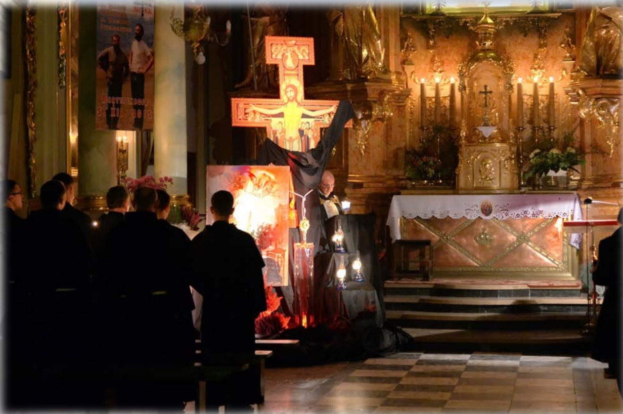
Transitus ceremony commemorating death of St Francis, 2015